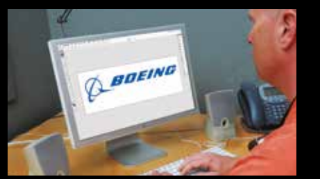
GRAPHIC DESIGN STUDIO

Our in-house graphics studio will take your logo and size it appropriately to the torch of your choice.